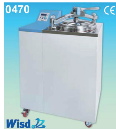
(1) Steam Sterilizers, Digital Fuzzy-Controlled Autoclave Standard-type