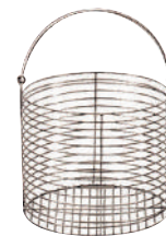
(3) Wire Basket Stainless Steel (Included)