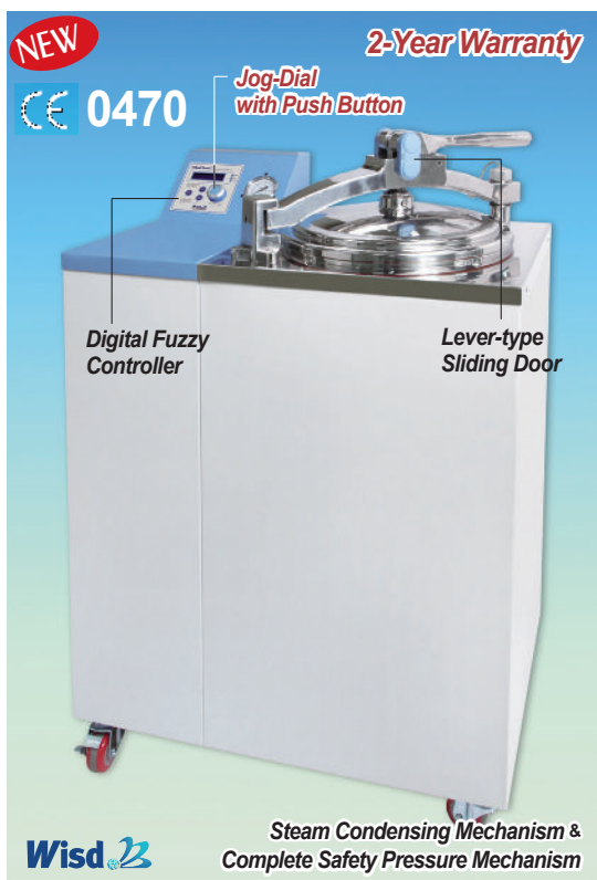
(1) Steam Sterilizers, Digital Fuzzy-Controlled Autoclave, With 2 x Wire Baskets Standard-type