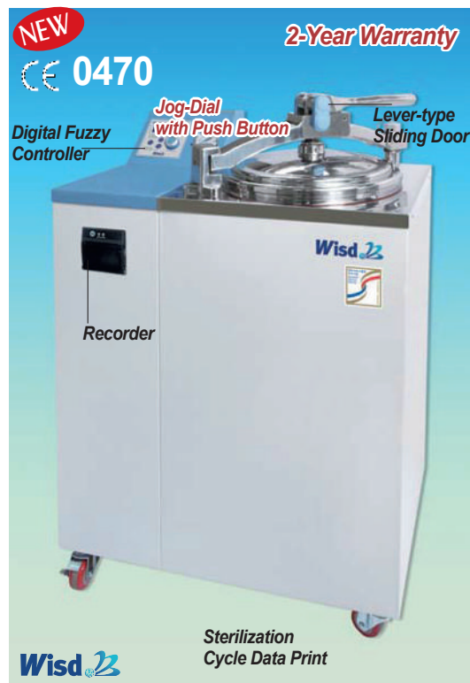
(2) Steam Sterilizers, Digital Fuzzy-Controlled Autoclave, With 2 x Wire Baskets Recorder-type