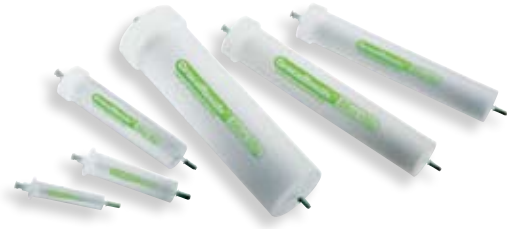
GraceResolv™ Cartridges – Luer Endfittings