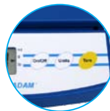
Simple three button operation