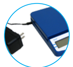
AC adapter included